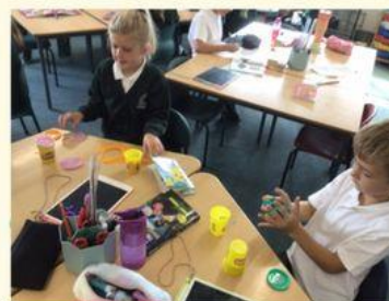
We made our characters out of play dough.