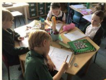
We have looked at food chains.