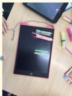
We used maths resources to create numbers.