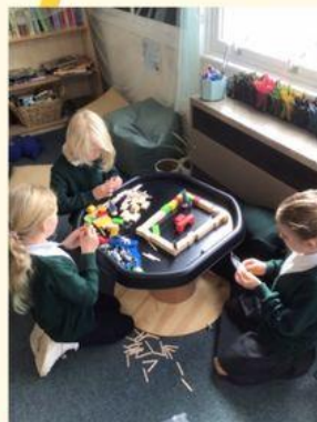
We created our stories in the small world.