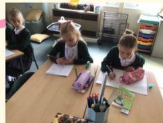
We created a story map.