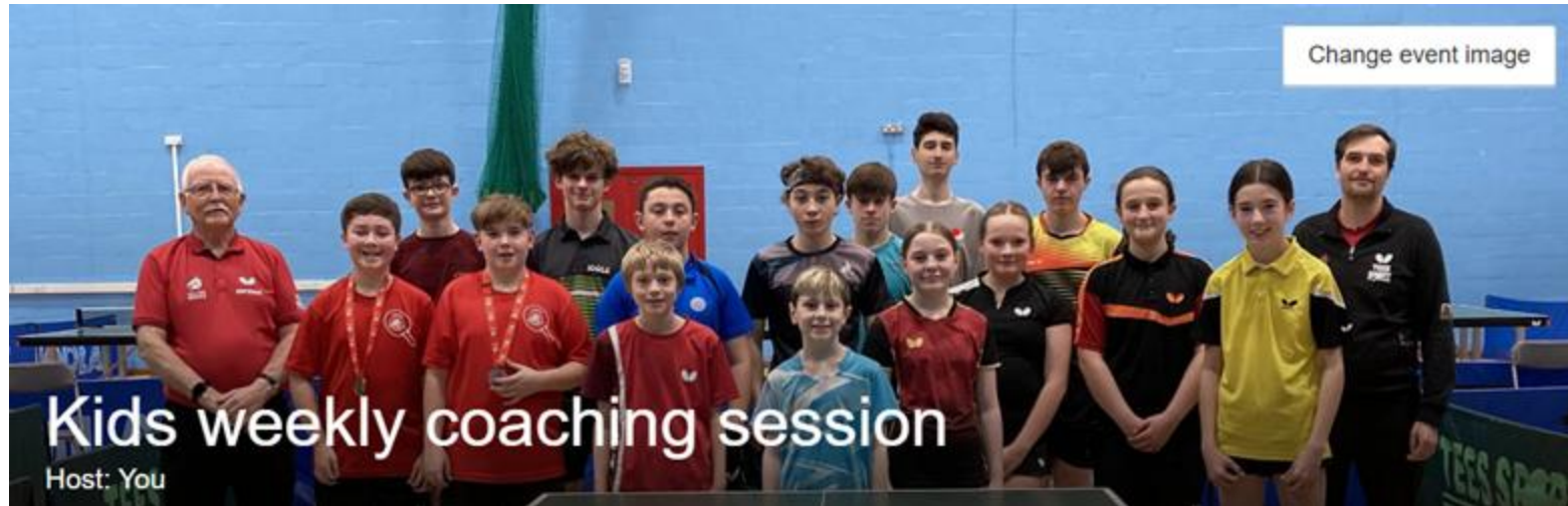
TABLE TENNIS SESSIONS!

SPOND Link to register on this Course: https://spond.com/invite/MWSTQ