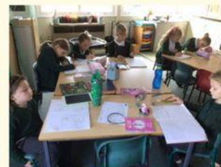
We thought about fruit and vegetables that we like.