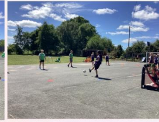
WE TRIED FOOTSAL