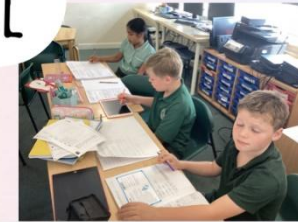
OUR CLASS WORK ON WONDER