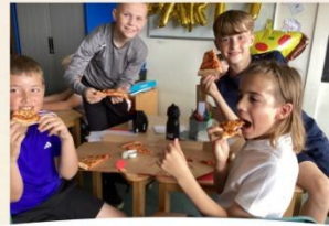
OUR ADOBE PIZZA PARTY.