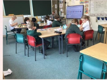
Reading time travelling with a hamster.