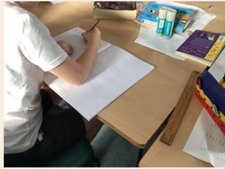
Expanded column subtraction.