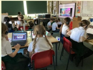
Anti-bullying week adobe work.