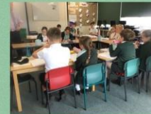
My happy mind