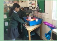
Our little ducklings