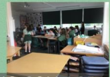
Feelings in RVE