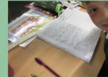
Our reflection writing