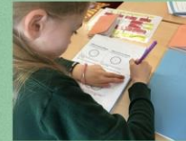
Time to the minute