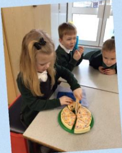
w/c 11.3.24 Dosbarth Jac Y Do