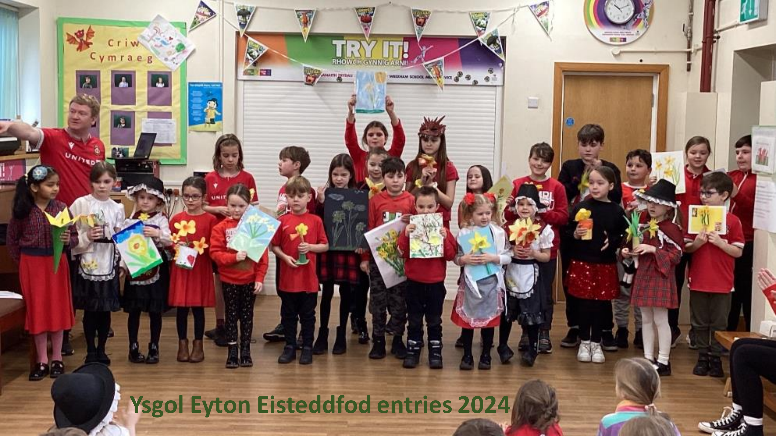
Ysgol Eyton Eisteddfod entries 2024