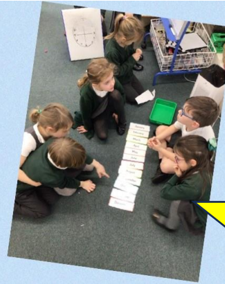
We carried on working on time.