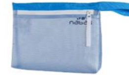
bag for wet costume