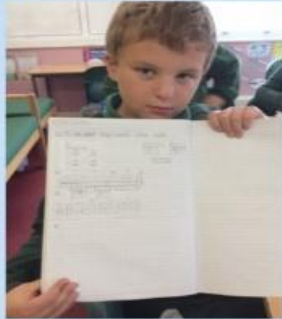
We are learning about expanded column addition .