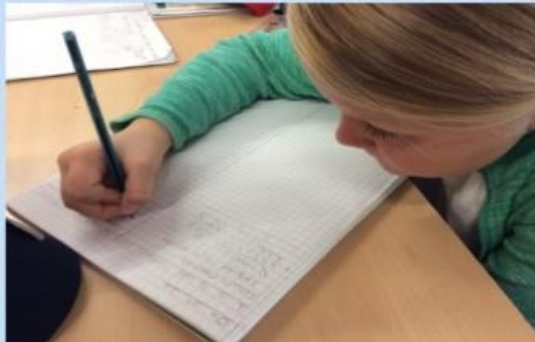
We wrote our own addition word problems.