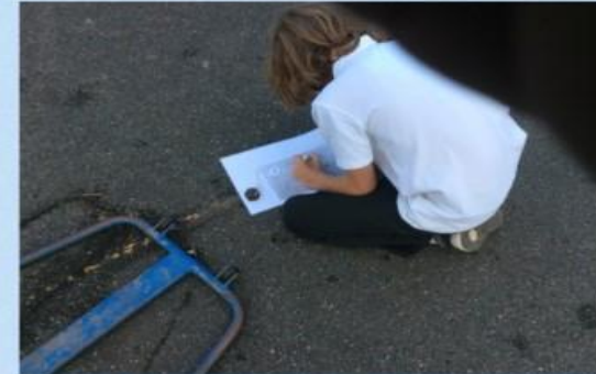
We learnt about compact column addition and we did some mastery activities outside.