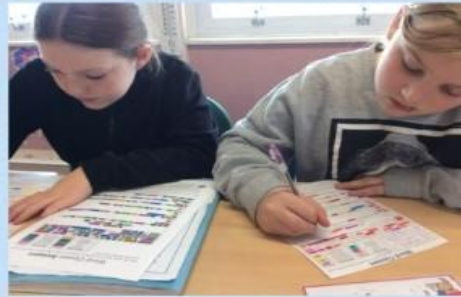
We are learning about adverbs ,nouns ,verbs,adjectives .