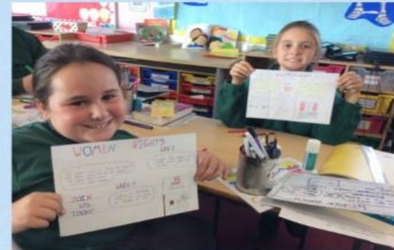
We made persuasive posters imagining that we were Suffragettes persuading people to fight for women's rights.