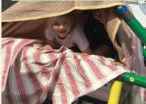
Building a shelter for the journey home.