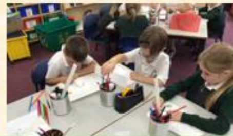
How to keep special books safe.