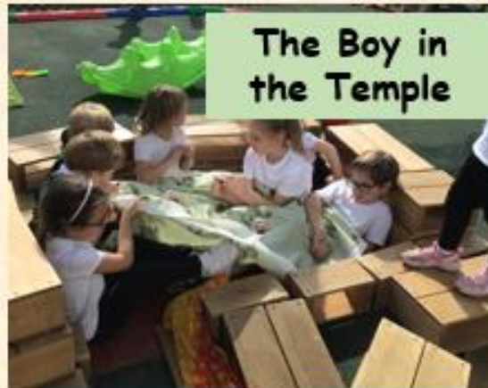
The Boy in the Temple