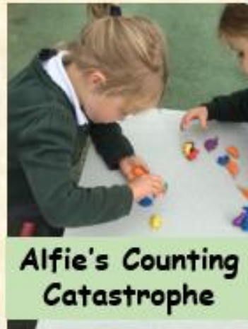
Alfie's Counting Catastrophe