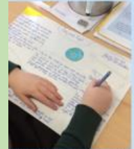
We finished our explanation texts about day and night on seasons .

Today was safer internet day and we learned how to keep safe on the internet.