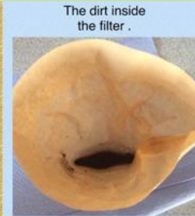
The dirt inside the filter .