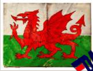
Tales of Wales